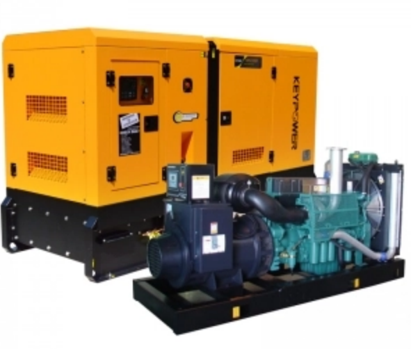
Generator Definition (Reference: keypowergenerator.com)

Even a major technological breakthrough, such as the incorporation of high-temperature superconducting materials into generator windings, is only likely to deliver a 0.2-0.4 percentage point improvement. Given that this is expected to result in an efficiency of over 99 percent, such low yields are somewhat unsurprising.