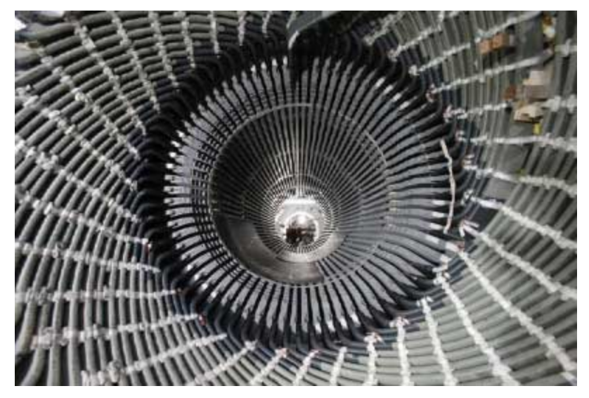
Material Changes of the Generator (Reference: powerengineeringint.com)

The difficulty with all of these strategies is that they enhance the generator's cost – as Hildinger pointed out, an accurate cost evaluation of each measure is required to ensure that it is cost-effective. It is feasible to compute the increase in output from a large generator as a result of using better steel or more copper, as well as the cost of the change, yielding a cost/kW for each improvement. If this is less than the price the generator owner will earn for each kW of electricity sold, the upgrades are worthwhile; otherwise, they are not.