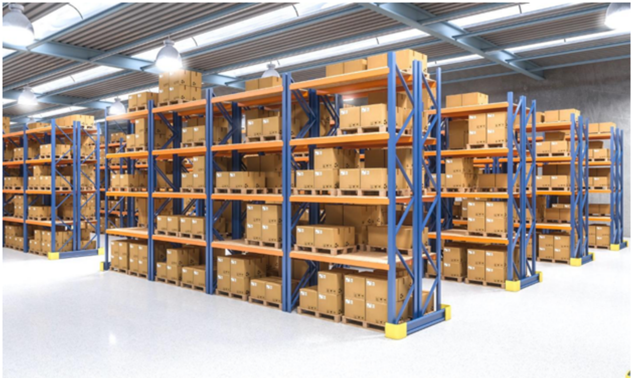
A Warehouse Pallet Shelving System

The correct pallet racking solution may have a significant impact on your bottom line. A well-designed system may boost efficiency, expand warehouse storage space by 40% or more, and assist your business in adapting to changing inventory requirements. It's tough to know which style of pallet rack is appropriate for your business. Some individuals use a selected pallet rack because it is the cheapest or because they believe it is the most adaptable, however it is ineffective for specific processes. Continue reading to learn about the many types of pallet racking systems and the optimal uses for each.