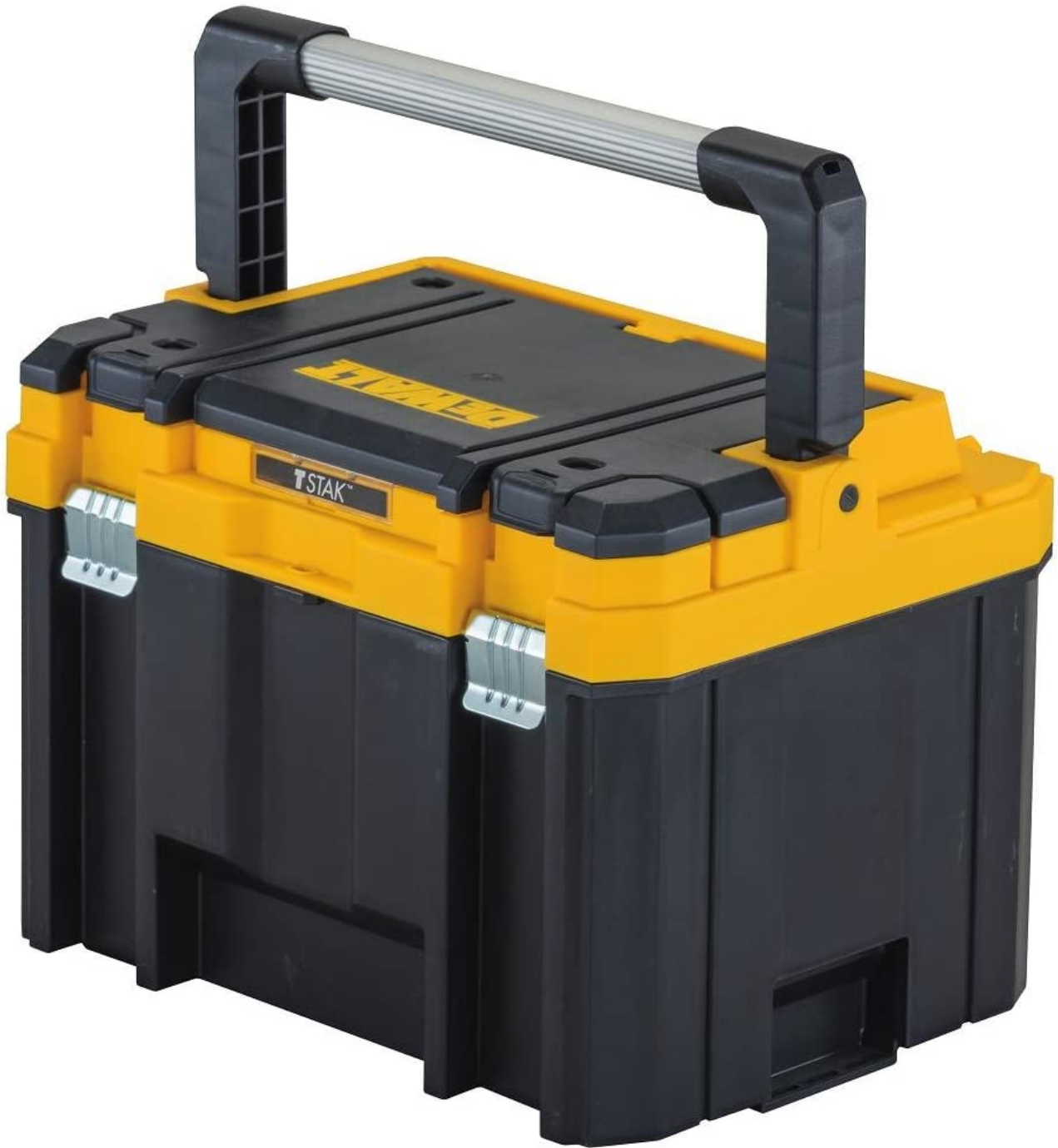
DEWALT TSTAK Tool Box (Reference: dewalt.com )