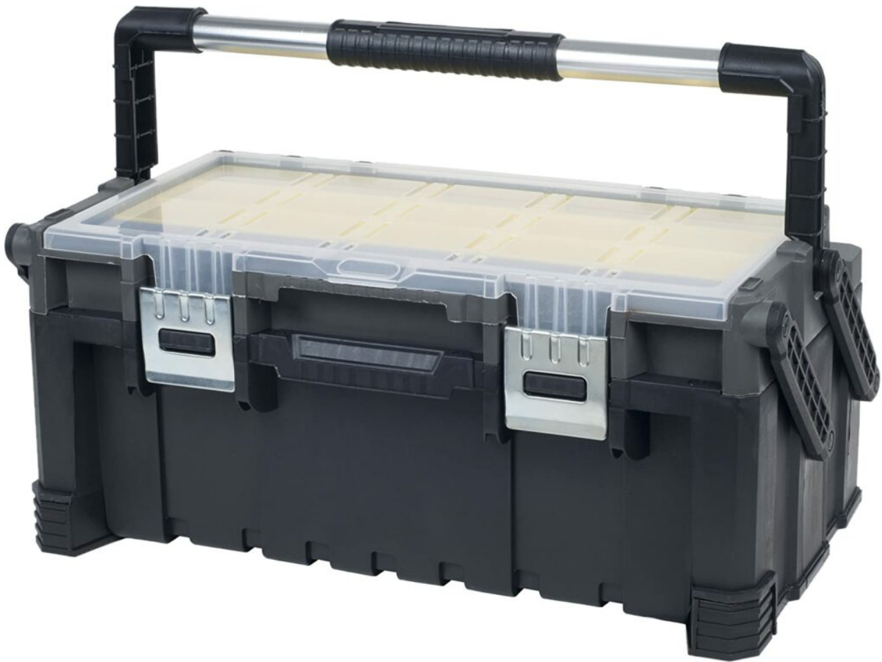
Stalwart 75-MJ5051B Contractor Grade Tool Box (Reference: stalwartproducts.com )