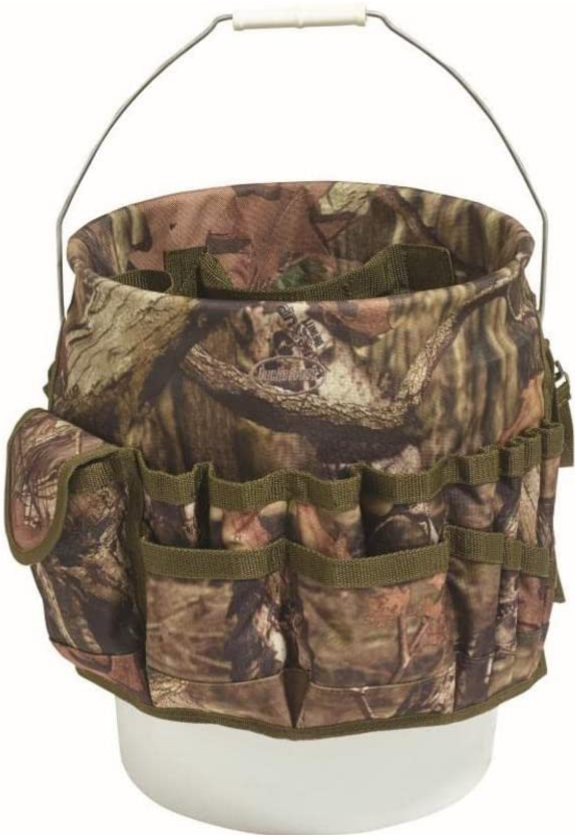
Camo Bucketeer Bucket Tool Organizer (Reference: bucketboss.com )