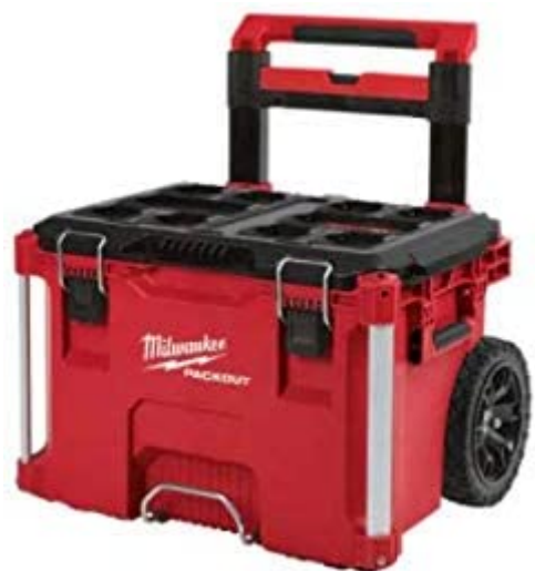
Milwaukee Packout Rolling Tool Box (Reference: milwaukeetool.com )