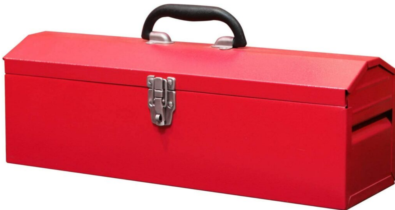
BIG RED TB101 Torin 19" Hip Roof Style Portable Steel Tool Box (Reference: bigredpowertools.co.uk )