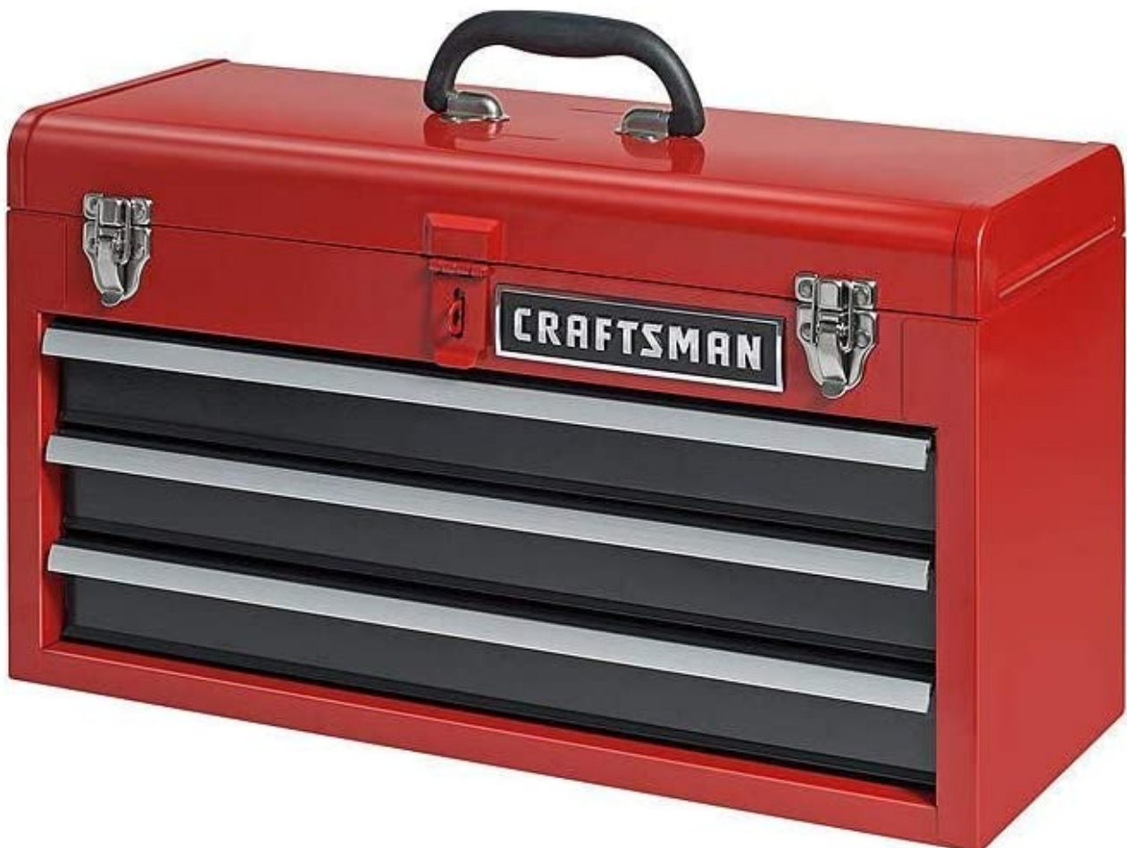
Craftsman 3-Drawer Metal Portable Chest Toolbox Red (Reference: craftsman.com )