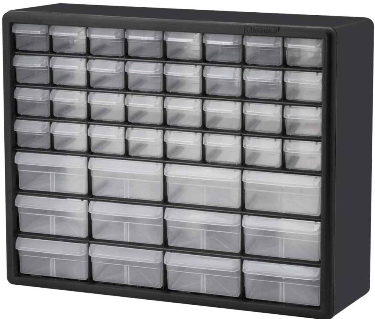
Akro-Mils 10144, 44 Drawer Plastic Storage Cabinet (Reference: akro-mils.com )