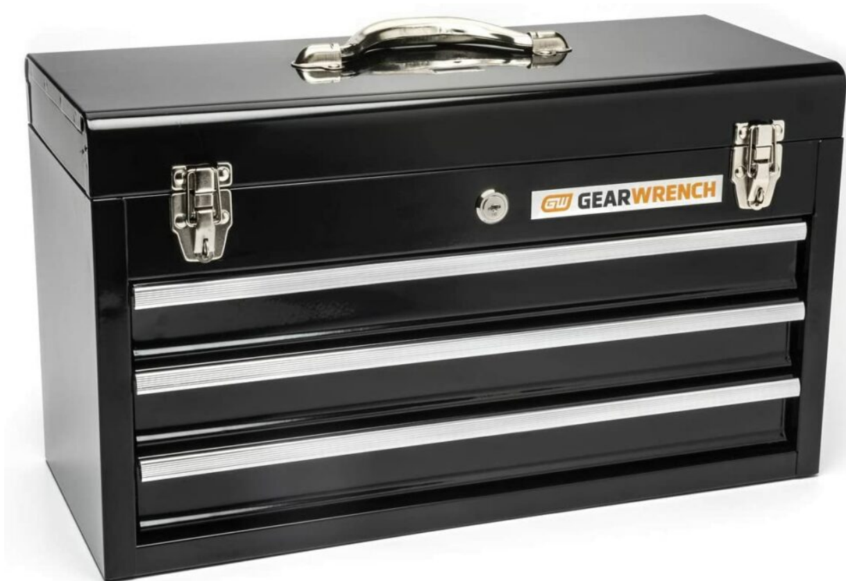
GEARWRENCH 20inch 3 Drawer Steel Tool Box (Reference: gearwrench.com )