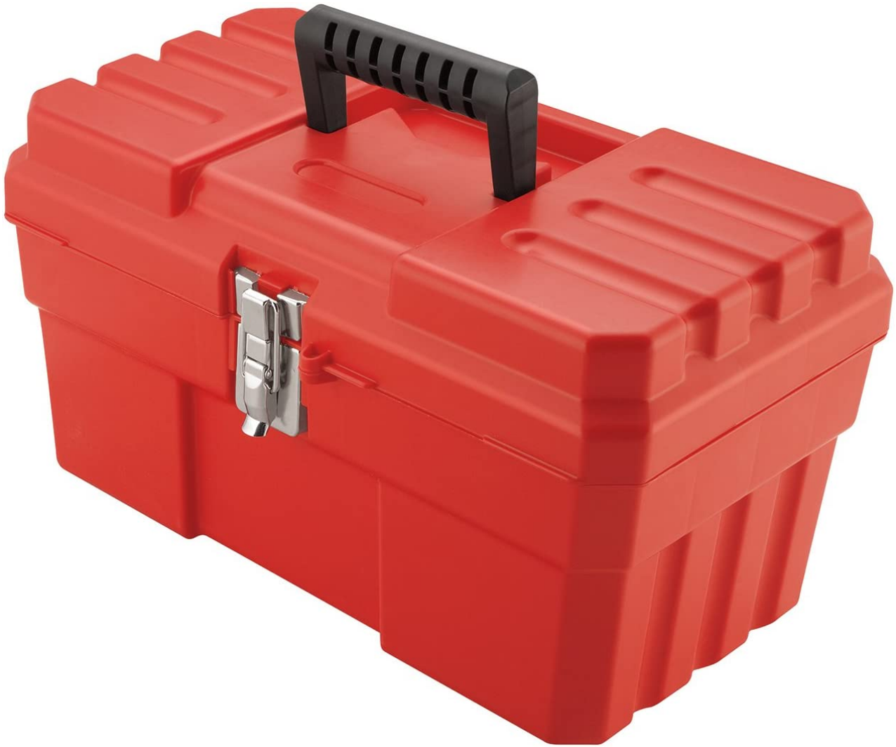
Akro-Mils 09514 ProBox 14-Inch Plastic Toolbox for Tools (Reference: akro-mils.com )